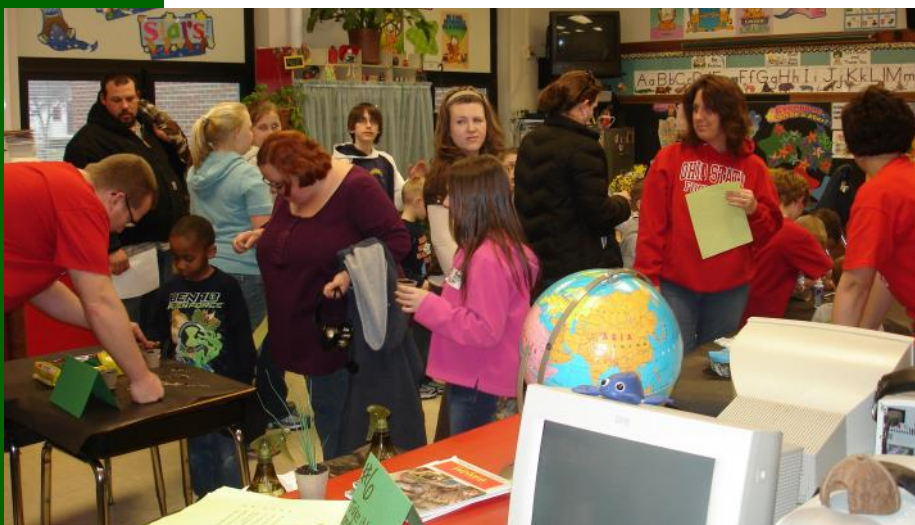
A Family Science Night at Cridersville Elementary School

Our Family Nights help make our families part of our school team.