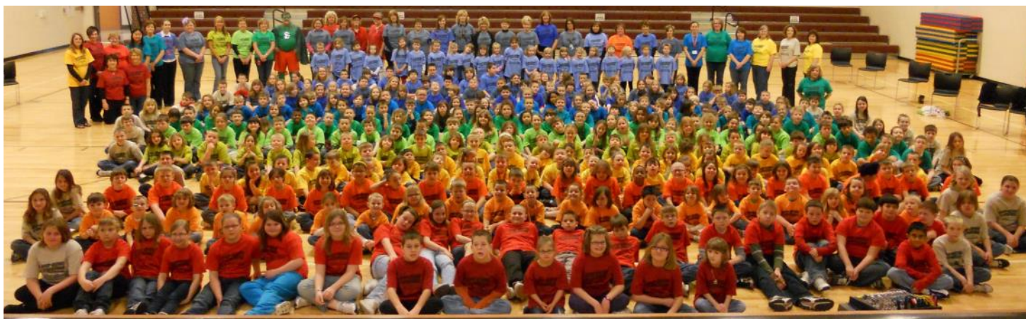
Our Cridersville Elementary School Community

Our Cridersville School Community is learning together to be responsible, respectful, and do our best!